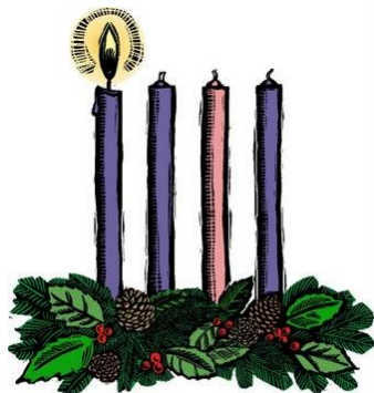
First Sunday in Advent

SACRAMENT OF RECONCILIATION: 1/2 hour before the weekend Masses or By Appointment